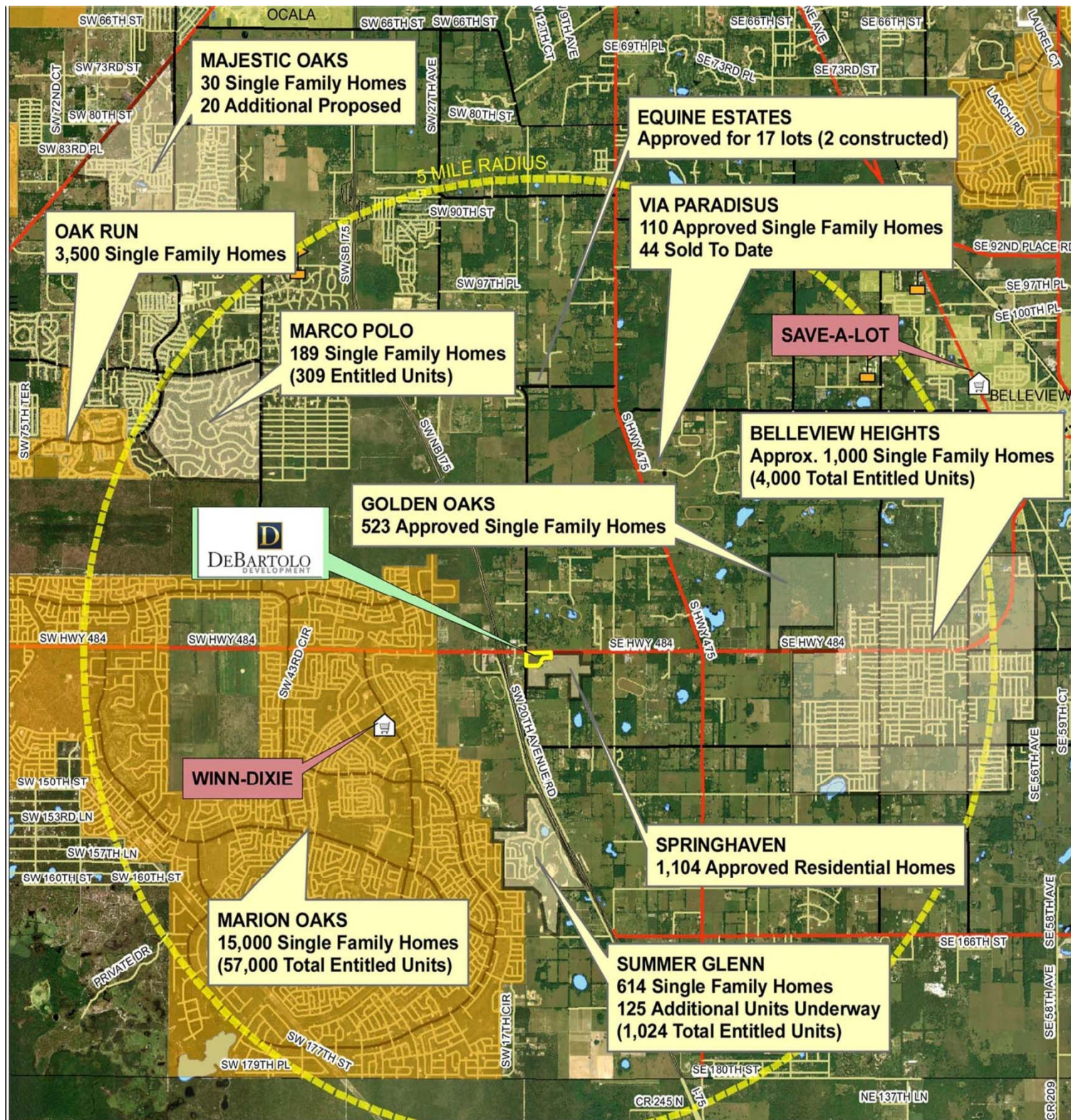
Future residential surrounding property

DEBARTOLO DEVELOPMENT 4401 West Kennedy Blvd. 3rd Floor Tampa, Florida 33609 Phone: 813.676.7677 Fax: 813.676.7696 www.debartolodevelopment.com